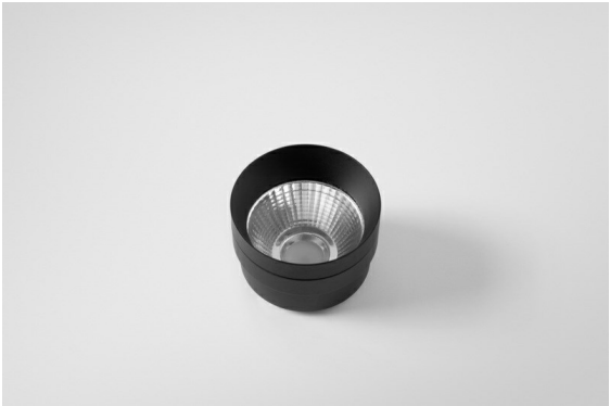
Magnetic reflector ø51 LED warm dim medium alu