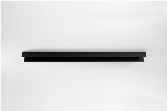
Cover 1274 1x United Black Structure