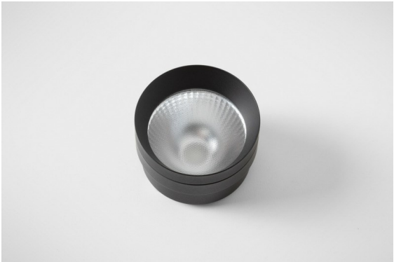
Reflector 51 Medium WD