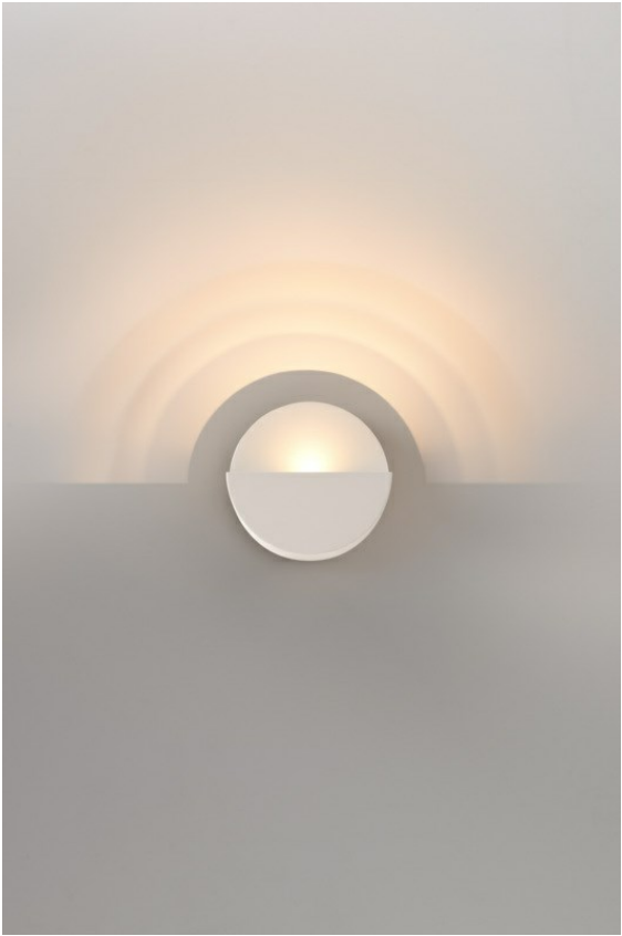
Impulse Round Wall expresses a unique experience in your space, where bows of shadow and light create depth and accentuate architectural features all around.