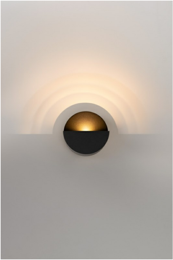
Impulse Round Wall expresses a unique experience in your space, where bows of shadow and light create depth and accentuate architectural features all around.